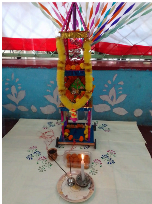
Chariot build in Ashaneer (left) and in Lalkuthi (right) during Rath Yatra